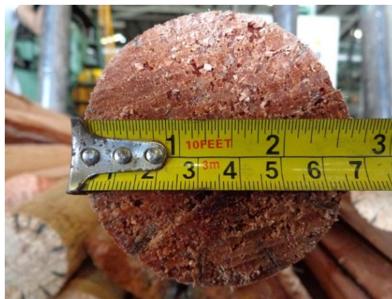
Figure 2. The pith (log-core) reaches a minimum diameter if maximizing the spindle-less type rotary lathe machine (Photo taken at PT Rimba Raya Lestari, Kutai Kartanegara, East Kalimantan).

One of the advantages of a rotary lathe spindle-less machine is it can leave a pith with a minimum diameter of up to 7 cm. So, it is very effective for peeling log-blocks even with a small diameter. Logs from plantation forests are usually harvested at small diameters, under 40 cm, as in Indonesia, the most popular species is Sengon Wood. So it doesn't matter if the peeled log-block has a diameter lower than 20 cm. Philips, et al. (1998) stated that if sawn-logs with a diameter of 8 inches (16.25 cm) were peeled and left a pith with a diameter of 4 inches (10 cm), the yield was very significant, which was about 21%. Figure 2 is an example of a pith 7 cm in diameter from one of the log-block peels.