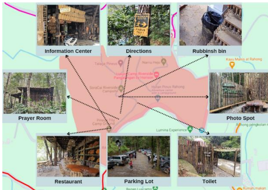
Figure 3. Map of Amenities in the Rahong Pine Forest Tourism Area

Supporting facilities or amenities are one of the things that must be considered in tourism development. On this tour the facilities provided are quite complete. There is a large parking area for 4-wheeled and 2-wheeled vehicles. To get to the entrance counter, you have to walk another 200m or so. There is a restaurant, prayer room and toilets around the reservation counter. On the way to the camping area, there are many directional and evacuation signs. In several places there are gazebos for visitors when it rains. For visitors who want to camp and don't want to bother with food, there is no need to worry because there is a restaurant that is large enough to accommodate many visitors. Toilets are adequate, there are almost every type of tent, unlike the highest type which has a toilet in each tent. Figure 3 provides information regarding the map of amenities in the Rahong Pine Forest Tourism Area.