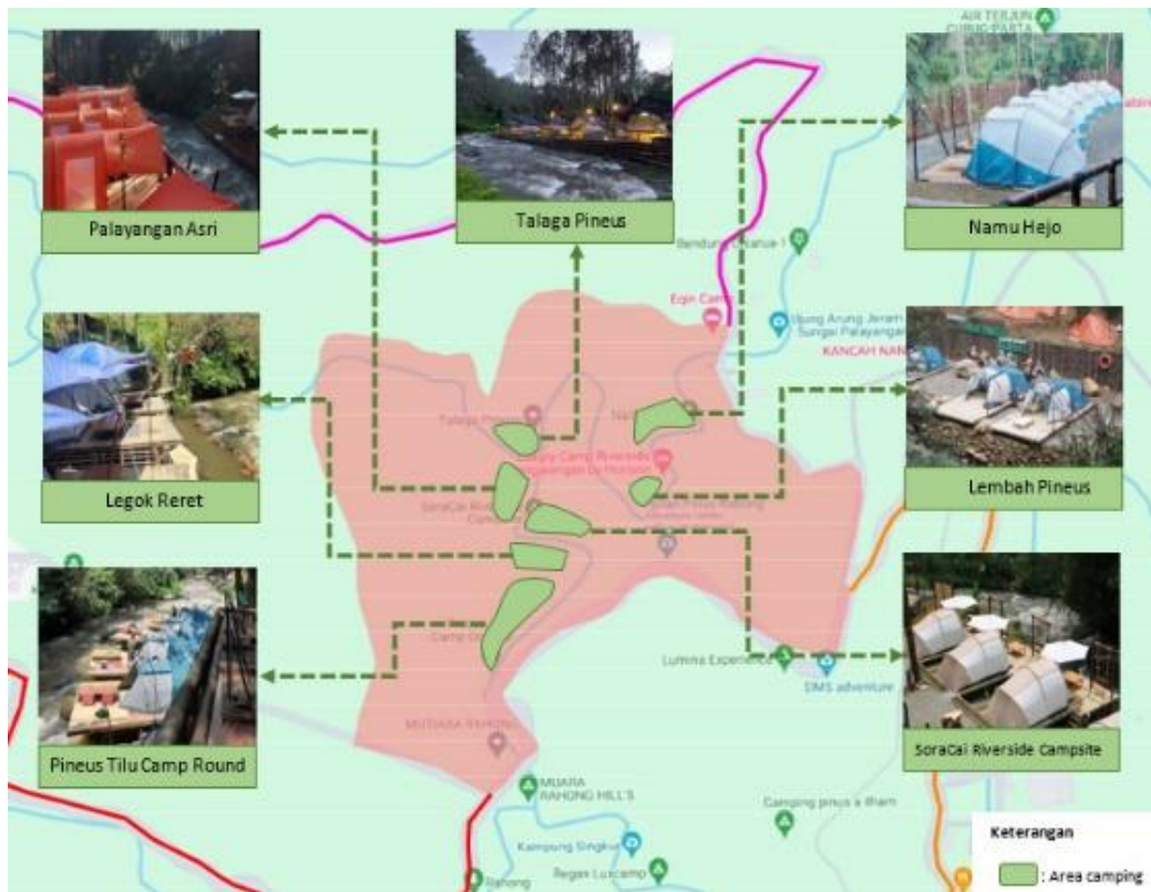
Figure 1. Map of Attractions in the Rahong PineForest Tourism Area

between IDR 500,000 to IDR 2,000,000. Figure 1 provides information regarding the map of attractions in the Rahong Pine Forest Tourism Area.